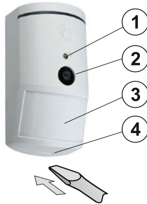
Figure: 1 – flash for illumination; 2 – camera lens; 3 – PIR detector lens; 4 – cover tab;

The detector can be installed on the wall or in the corner of a room. There should be no objects that can quickly change temperature (e.g. heating appliances) or which move (e.g. curtains hanging above a radiator, robotic vacuum cleaners) or pets in the detector's field of sight. It is not recommended to install the detector opposite windows or in places with intense air circulation (close to ventilators, heat sources, air conditioning outlets, unsealed doors, etc.). There should be no obstacles in front of the detector which might obstruct its view of the protected area.